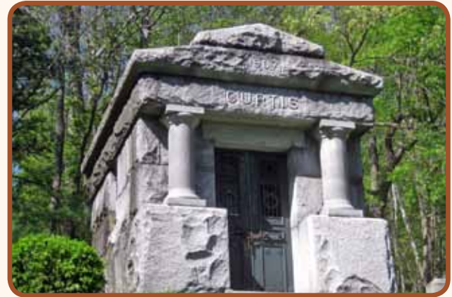
Curtis Mausoleum 1907