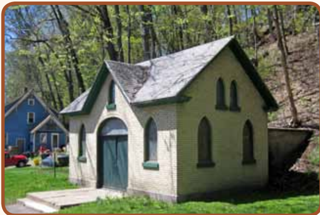
Owego Mortuary Chapel

small stone markers. Most have metal pegs with a number stamped into the top of them, but they are pushed into the ground and cannot be seen unless one looks for them. There is also a section (12) referred to as the “Firemen’s” section, and what used to be the “Mason’s” section (15), but the Mason’s section has been donated to the village. Since 1851 the cemetery has more than quadrupled in size, growing from eleven and one-fifth acres to 51.2 and is divided into twenty-two sections.