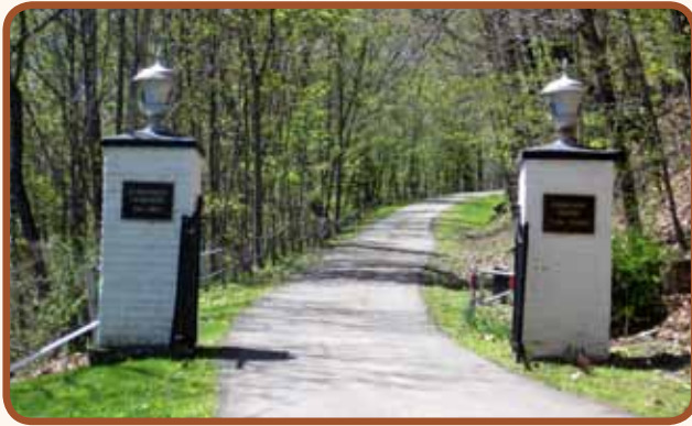
Entrance to the cemetery