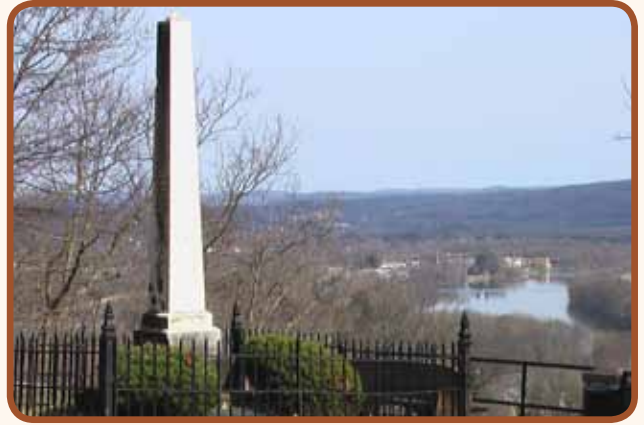
SaSaNa Loft Monument

Included in the cemetery is a section for the Civil War burials. The boundary line of that section is accentuated with four cannons, creating an impressive appearance. There is also a Potter's Field located at its lowest point. Although there are many burials in it, there are only a few