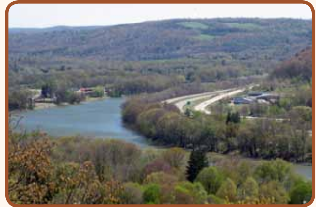
East view from the summit